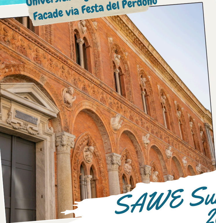
Università degli Studi di Milano Facade via Festa del Perdono